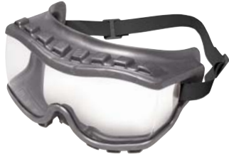
Clear — Ideal for most indoor work applications